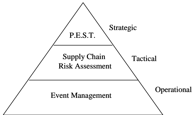
Figure 3 : Supply Chain Knowledge

The third level of knowledge is operational and pertains to the day-to-day management of the business. The emerging field of Supply Chain Event Management (SCEM) is potentially of great value in this regard [17].